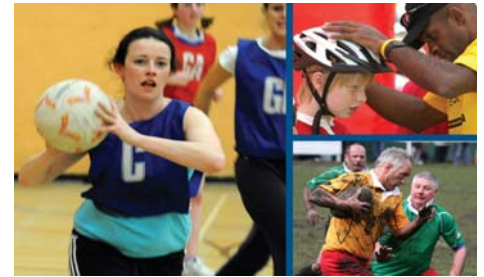
Creating sporting opportunities in every community

In addition, within the 'sustain' outcome of Sport England's strategy, a number of sports will aim to reduce the drop off in participation among 16-18 year olds. This document summarises key data in relation to the above strategic outcomes, drawn from Sport England's Active People Survey .